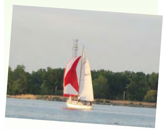
Rakaia in action

"B" and "C" fleets will have a make-up race scheduled for a later date.