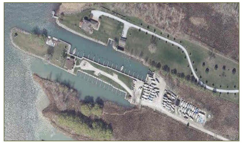
Aerial photo - a view of LMYC