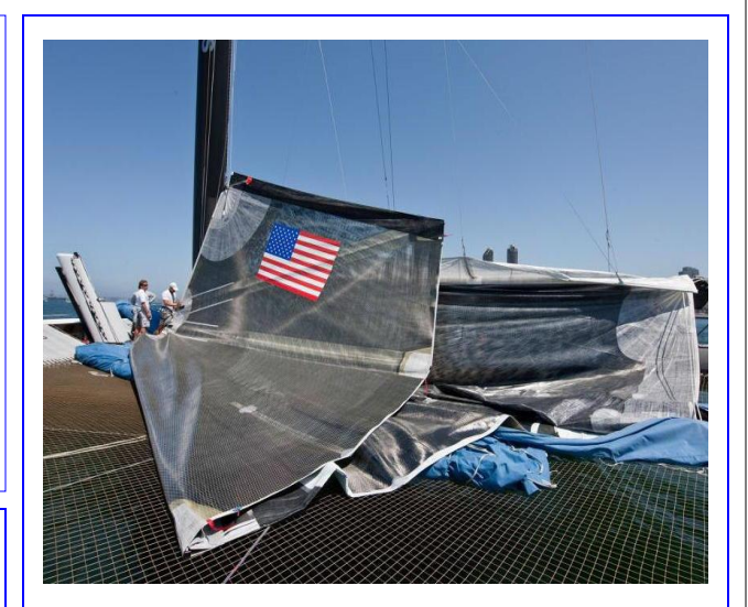
It's a matter of perspective. This is the headboard of the mainsail of America's Cup Gogzilla

A warm and sunny day greeted the participants of this year's fund raising event. After the morning's skippers