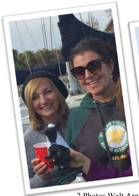
2 Photos Walt Argent