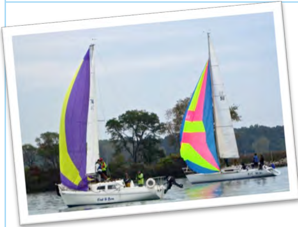
Boats fought to keep their spinnakers flying.