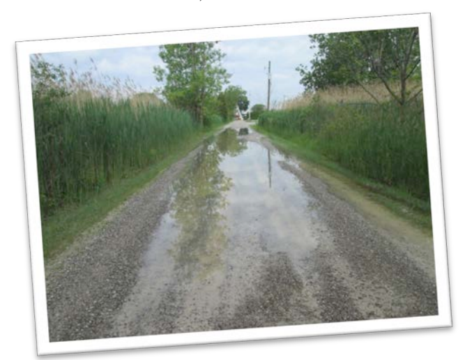
Flooded Lake Mariner laneway and even a pond developing in the parking lot.

This is a year we need members to step up. If you have 12 work hours in, start on the second 12.