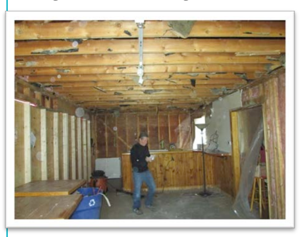
Below rafters go in for the revised roofline.

The big job of remodeling in the clubhouse has affected every space. The entire place is being redone in one way or another. The ongoing wet weather and high water has hindered those efforts. Below is a photo of the main room with the counter at the far end. Floor, walls and ceiling have their coverings removed.