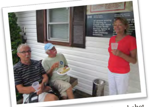
Sometimes it's so pleasant to just sit and chat.