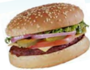
3 Photos Lothar Bauer

All the racers express our thanks to the Committee Boat crew that comes out faithfully to record times and calculate the scores each racing event. Their dedication at every event makes for successful competition among the many racers that make L.M.Y.C. their club of choice.