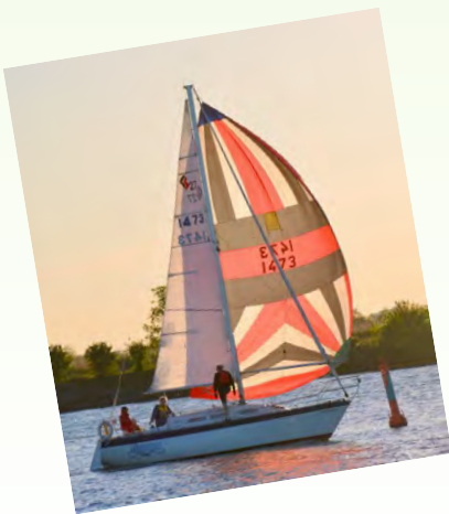
A Sunset Finish