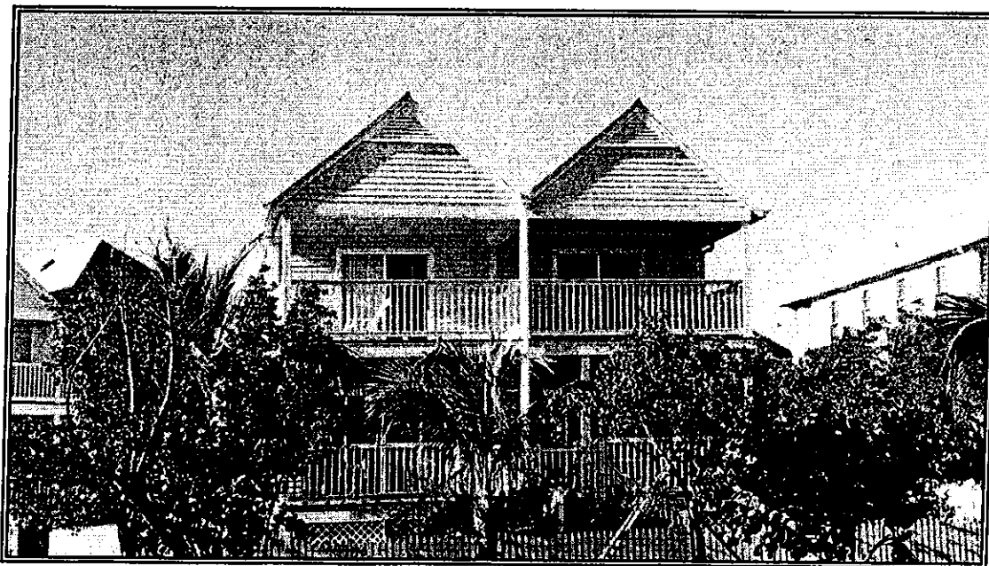
Condominium in Key West Florida