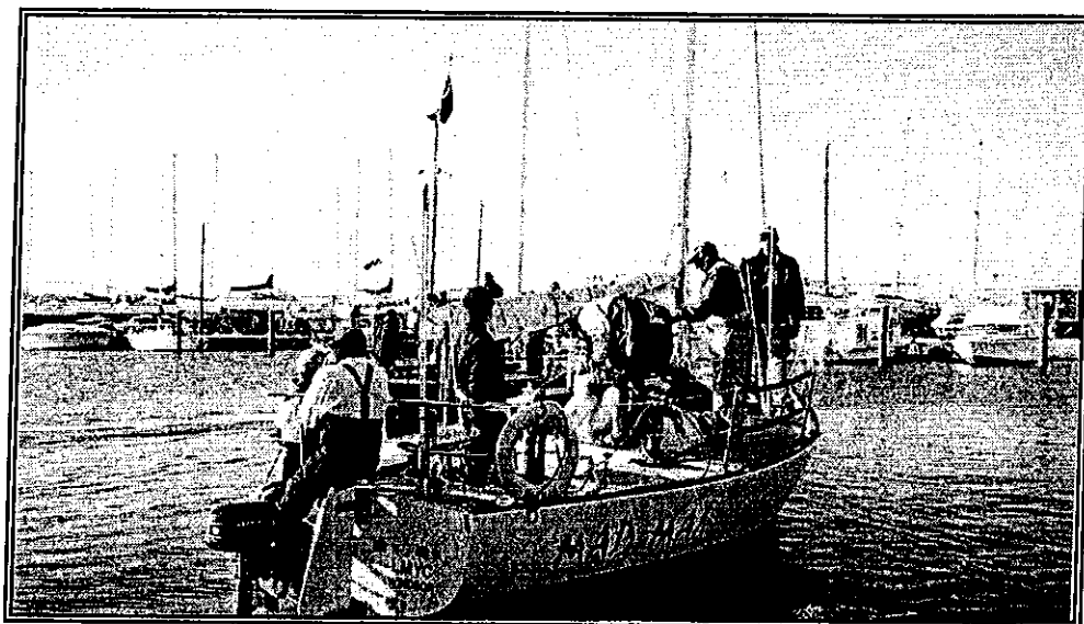
Friday January 21 - Heading out to battle